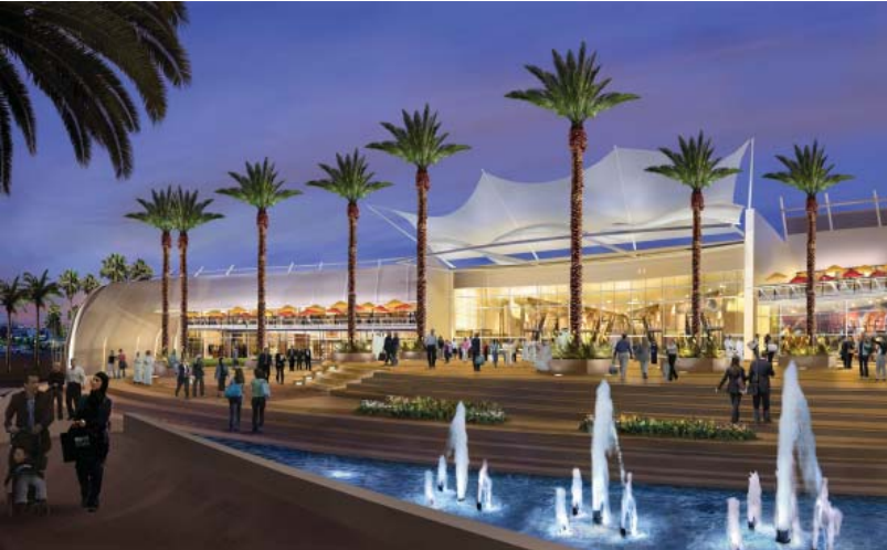
Rendered views of the development.