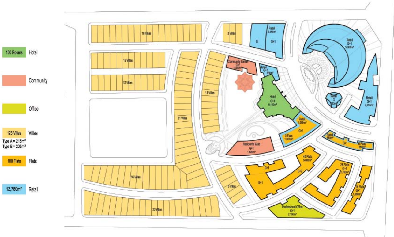
Development Use Plan